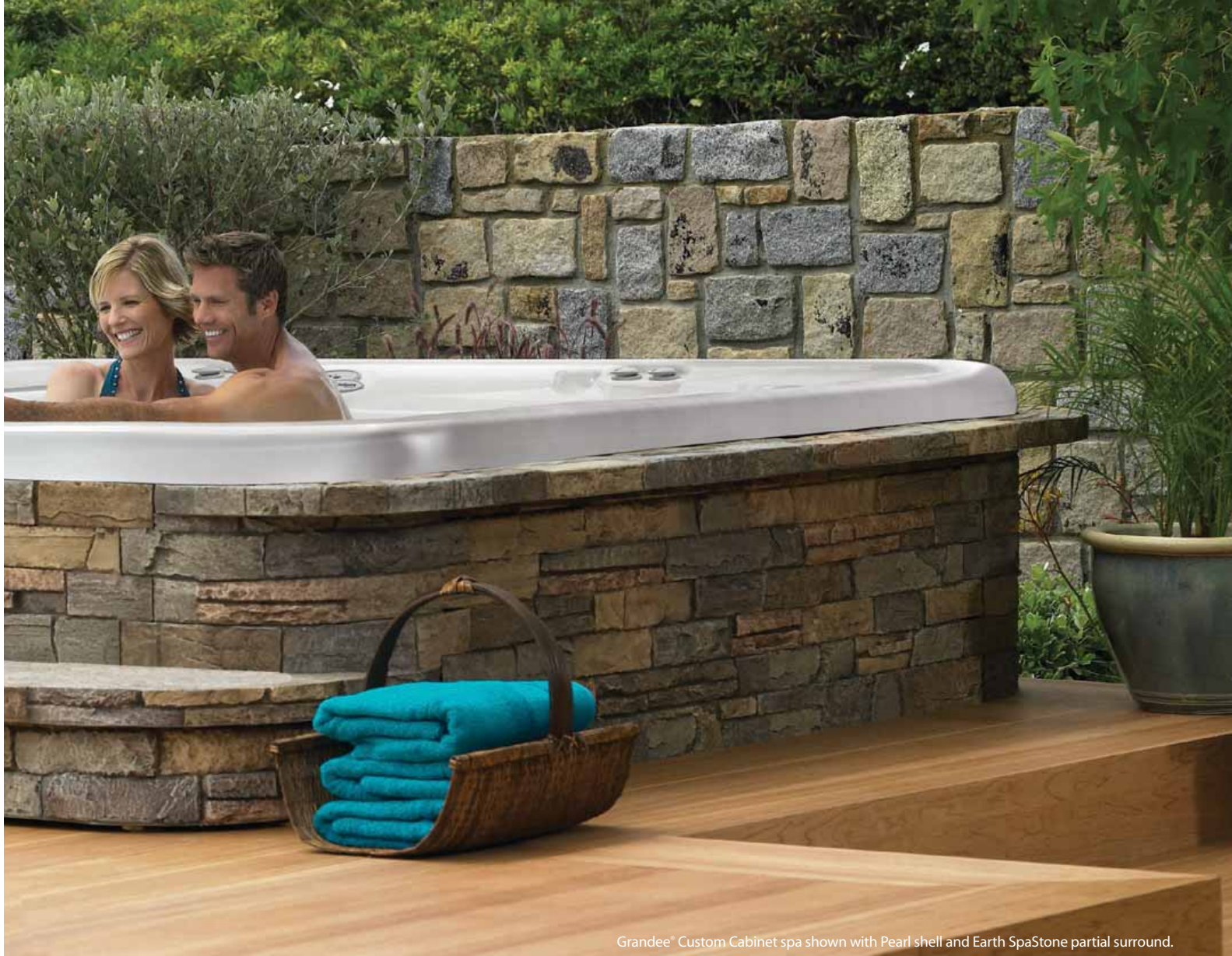
Grandee® Custom Cabinet spa shown with Pearl shell and Earth SpaStone partial surround.