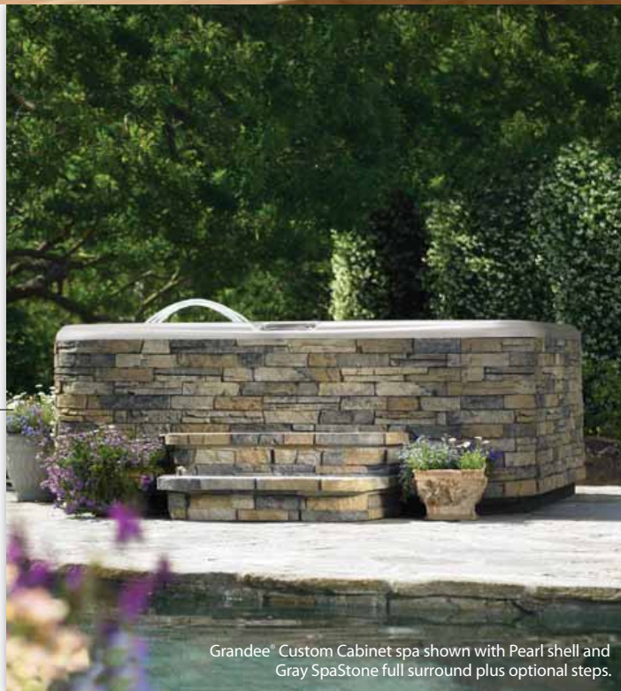
Grandee® Custom Cabinet spa shown with Pearl Shell and Gray SpaStone full surround plus optional steps.

Add the optional CoverCradle® cover lifter to a full surround spa, or the UpRite® cover lifter to a partial surround installation. After a nice relaxing soak, you'll appreciate how easily your cover glides back in place.